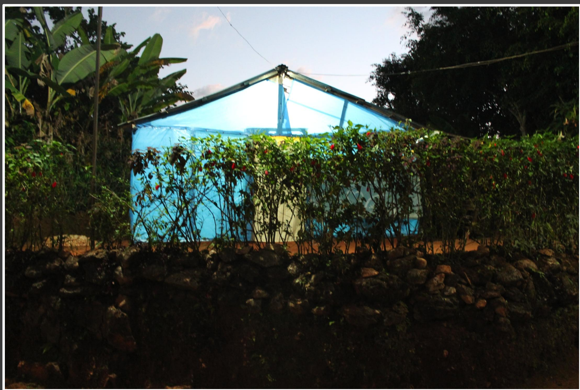
Church in the rural countryside--De Bois Rouge