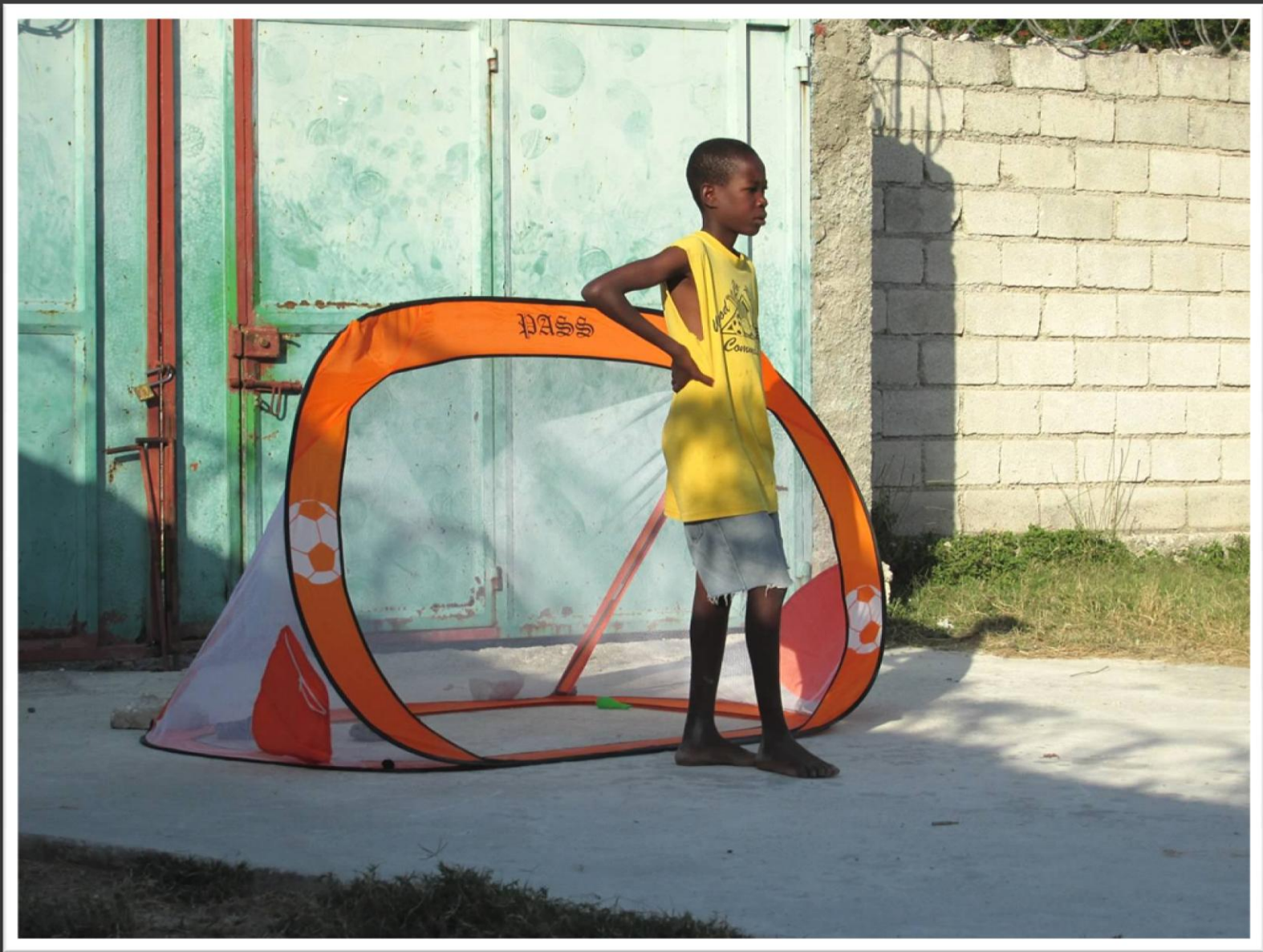
New soccer goals