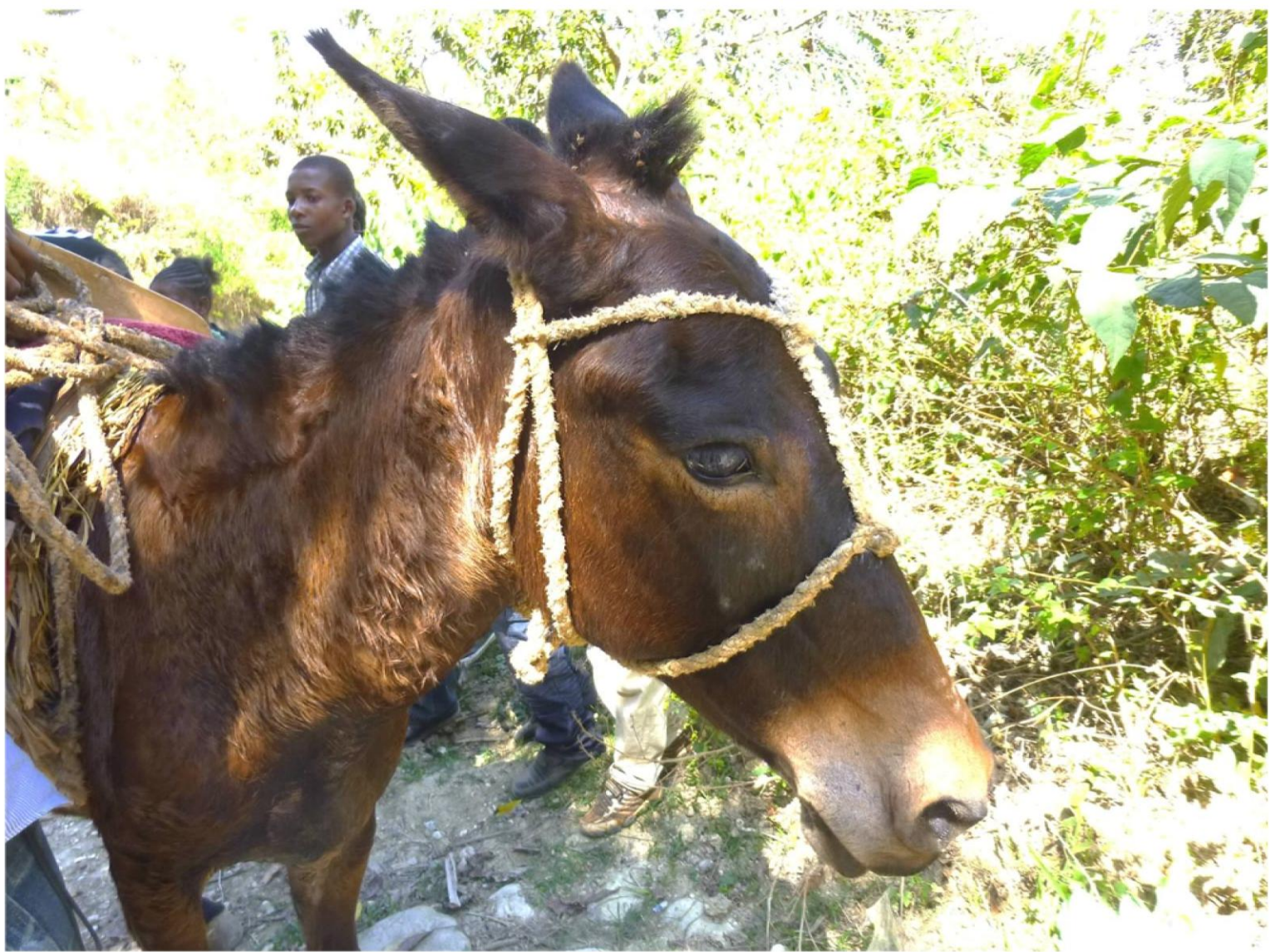
The donkey FUMC bought for Drix