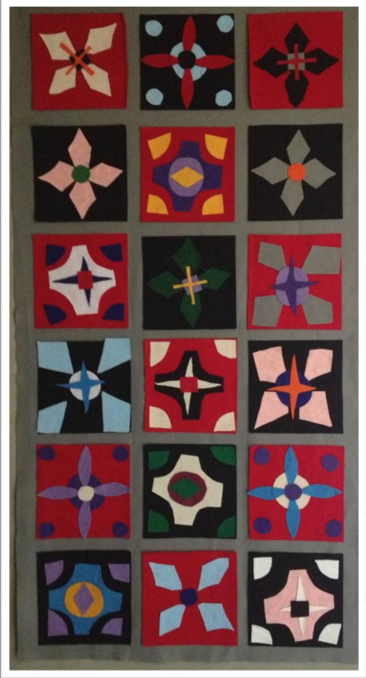
Banner in the upstairs hallway